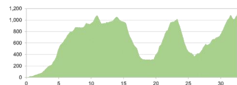
The elevation profile for the long course